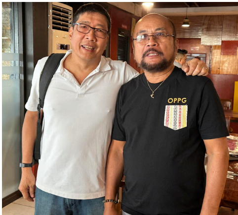
The man on the left from DOLE with the man from DoLE